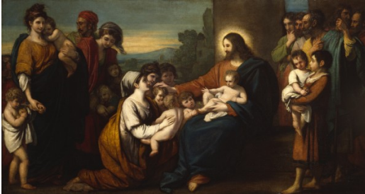
Jesus Touches the Children

Luke 18:15-17+ And they were bringing even their babies to Him so that He would touch them, but when the disciples saw it, they began rebuking them.