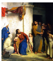
JESUS TAKING A CHILD

Matthew 19:15+ After laying His hands on them, He departed from there.